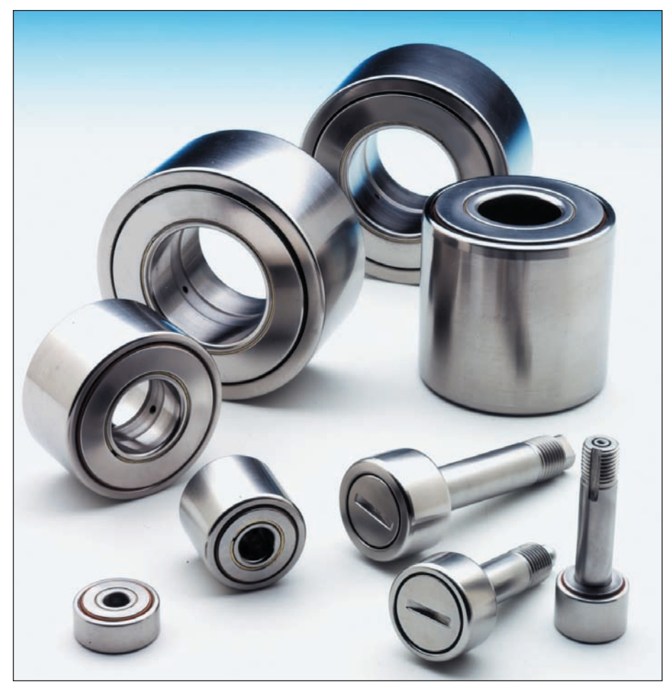
Outstanding corrosion resistance is the key to the reduced maintenance and extended service life of RBC's new AeroCres<sup>®</sup> grease bearings.

Effective Seal – Improved onepiece copolymer design provides better protection and lubricant retention, even at regreasing pressures up to 5,800 psi (400 bar).