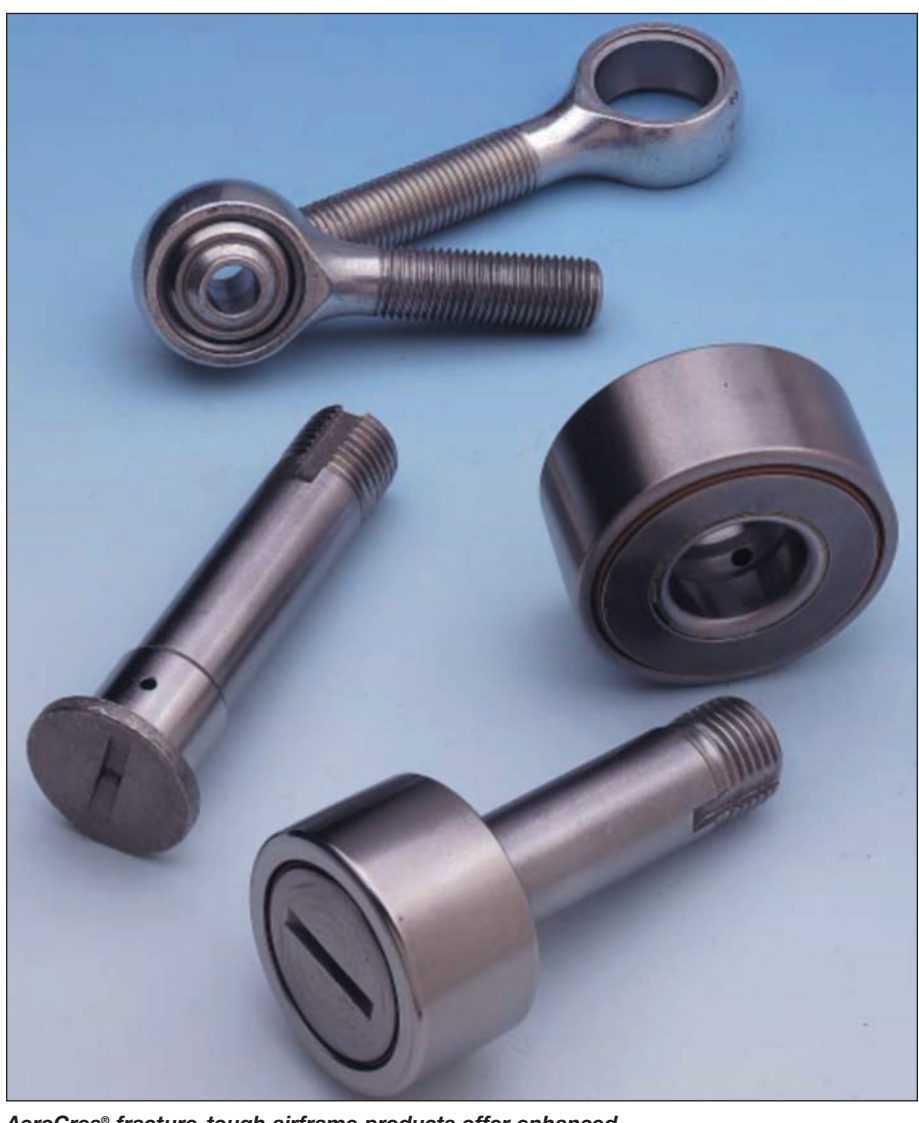
AeroCres® fracture-tough airframe products offer enhanced corrosion resistance in harsh operating environments.

Currently, this new material is being used for many structural bearing components such as rod end banjos, track roller studs, and outer rings. Fracture toughness, corrosion resistance, and long fatigue life are critical requirements for these components.