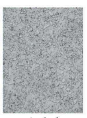
AeroCres® fracture-tough material